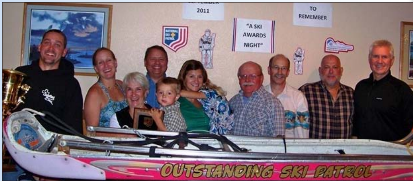
Missoula Patrol at Division Meeting, Outstanding N. Division Patrol

Let's make the 2011-12 Ski Season Northern Division Awards "A Year to be Remember"