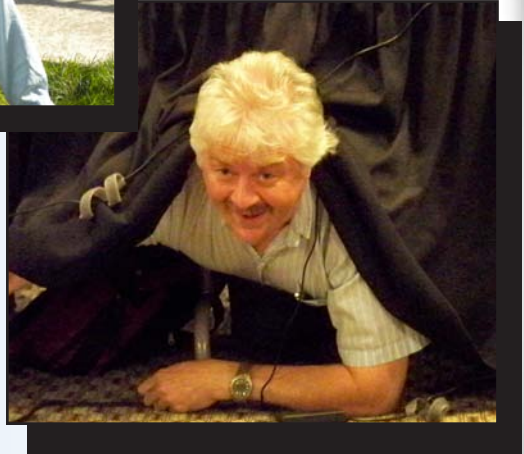
Some things we're better off NOT knowing . . .