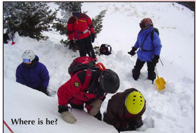
Where is he?